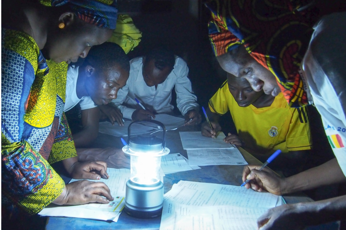
Counting of votes during the parliamentary elections in December 2013