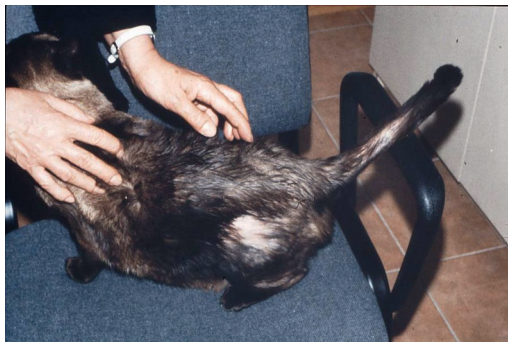
Fig. 2. Stress may not only trigger bouts of over-grooming but also play an important role in maintaining chronic dermatopathies. Multimodal management of such cases is essential.

Not only is anxiety a mental health problem in its own right and a risk factor for the development of a range of physical health problems as described in the previous