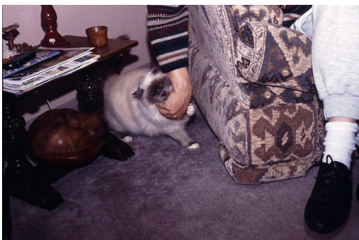
Fig. 5. Encouraging inappropriate play can not only lead to problematic behaviors like biting, but also become part of a stressful cycle as the owners try to punish what they see as inappropriate behavior by the cat.

Interventions to manage stress will always be important, but minimizing the stress response in the first place would be ideal. To this end, early life experiences can be manipulated to help pets cope with stimuli that may put them at risk for arousal and negative emotion. A review of the literature of puppy and kitten development is outside the scope of this article, but there is extensive evidence of correlations between certain early life events and the expression of problem behavior later in life. 58,59 Although