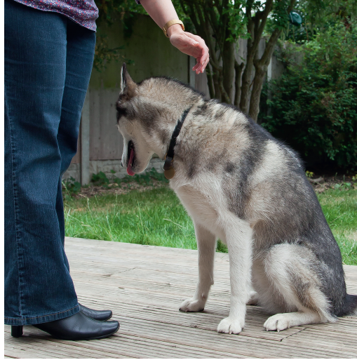
Fig. 1. It is important for clients to recognize the subtle signs of discomfort, such as a head turn, rather than force the animal into stressful situations that may provoke a more overt response.

compliance more likely), because redundant measures can be identified and excluded more effectively. If left untreated or treated inappropriately, the chronic arousal associated with long-term stress can also have serious physical health impacts, once again emphasizing the importance of accurate assessment and appropriate interventions ( Box 1 ).