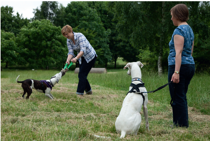
Fig. 3. Dogs need to learn frustration control, so they do not get over-aroused when denied the opportunity to engage in a pleasurable activity.

Control implies that the animal has acceptable choices available to it that it can use to reduce the impact of the stressor for itself; for example, a dog that is not at ease with unfamiliar people and does not have anywhere to retreat to when visitors arrive has no