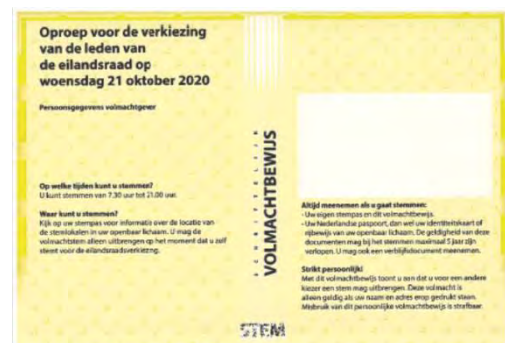
Written voter proxy sample

The ACE Electoral Knowledge Network indicates that proxy voting is permitted under the law in very few jurisdictions globally (both the Netherlands and the United Kingdom offer the option), noting that “a proxy vote may be given where a voter is unable to attend a voting station through infirmity, employment requirements, or being absent from the area on