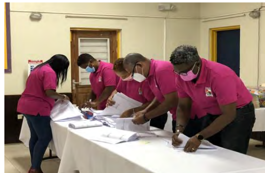
Polling officials count ballots in Lion's Den at close of polls while voters, candidates, and journalists watch

Directly following counting, the sealed results packets and results form ( proces-verbaal N 10-1 ) were handed over to the police for safe keeping. Final results were publicly declared two days later, by which time the IFES Team had departed the island, at a meeting of the Central Voting Bureau. The final results showed a total of 1616 votes cast (1586 valid votes, 14 blank votes, 16 invalid votes), with 815 votes for the PLP, 647 DP and 124 for UPC. At the time no explanation was given for the difference of one vote cast. 81 Interestingly, the DP received more votes at the Lion's Den and the PLP received more votes at the Sports Center. Based on the final results, the seat allocation remained the same as announced at the time of the preliminary results announcement.