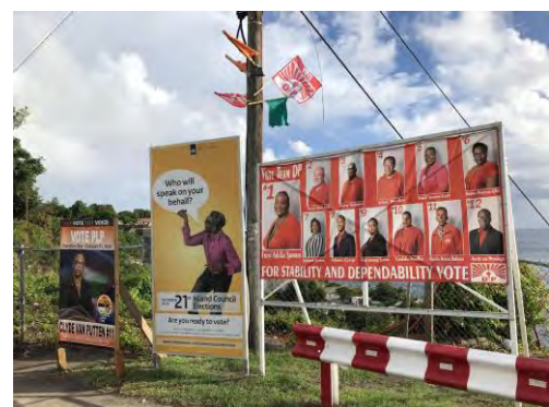
Political party and voter advertising

In normal times, the principal/central electoral committee is composed of five members, including a presiding officer, a deputy presiding officer and three deputy members. The Island Governor acts as presiding officer, and other members are appointed by the Island Executive Council. While there are clear eligibility requirements in the law, the appointment and dismissal process are not further elaborated, and it is conceivable in such a small community that these appointments would be called into question as not being impartial. Presumably, this electoral committee will be