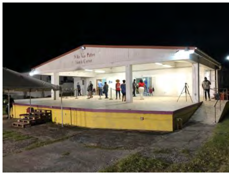
Lion's Den Polling Station

Voting progressed smoothly throughout the day with voters casting their ballots in secret and with no visible signs of intimidation. Approximately six electors had difficulty communicating with the polling officials, in part due to the ballots only being available in Dutch. Voting bureaus closed on time at 9:00 pm, as there were no electors in line at closing time. In addition, approximately ten electors were turned away due to a lack of or improper identification. 63