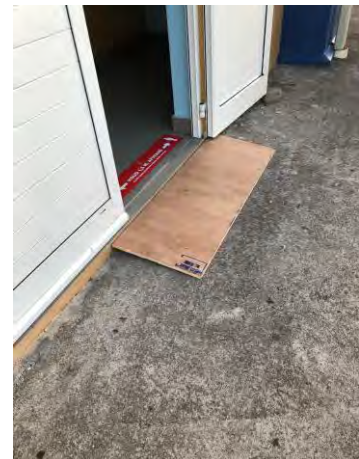
A newly installed ramp to improve accessibility

According to the Kiesraad , “the Executive Board has a duty to ensure that no fewer than 25% of the total number of voting bureaus are accessible to voters with an impairment.” 83 Parking facilities, bathrooms and entrances to the voting bureau at the Sports Center were fully accessible to voters with disabilities, and a public awareness campaign encouraged persons with disabilities to vote at its location. The voting location at the Lion’s Den was not fully accessible because there was a single step at entrance to the voting bureau which would prevent wheelchair access. The Lion’s Den and Sports Center locations had four and three voting booths, respectively, separated by privacy screens. The voting booths were adjustable and at least one was set at a level to facilitate voting by wheelchair users. The opaque ballot boxes were labeled and suitable for the occasion, although consideration should be given to use more traditional ballot boxes in the future.