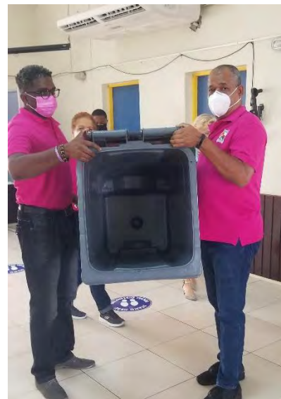
Voting bureau members display empty ballot box before polling

The voting locations were laid out to facilitate adherence to COVID-19 protocols. 62 The staff of the voting bureau sat behind plexiglass dividers which separated them from voters, while they themselves sat six feet apart from each other. There were markers on the ground indicating where voters were to stand to ensure they remained two meters apart. The hands of voters were sanitized three times during the process: at the entrance, after interacting with the chairperson of the voting bureau before voting and upon leaving the polling station. Voters used separate doors to enter and exit the locations to ensure they did not have to come in close contact with each other. The voting booths and the pencils were sanitized immediately after each voter exited the voting booth. The vast majority of voters adhered to the COVID-19 protocols by observing social distancing, sanitizing their hands and wearing masks. They also