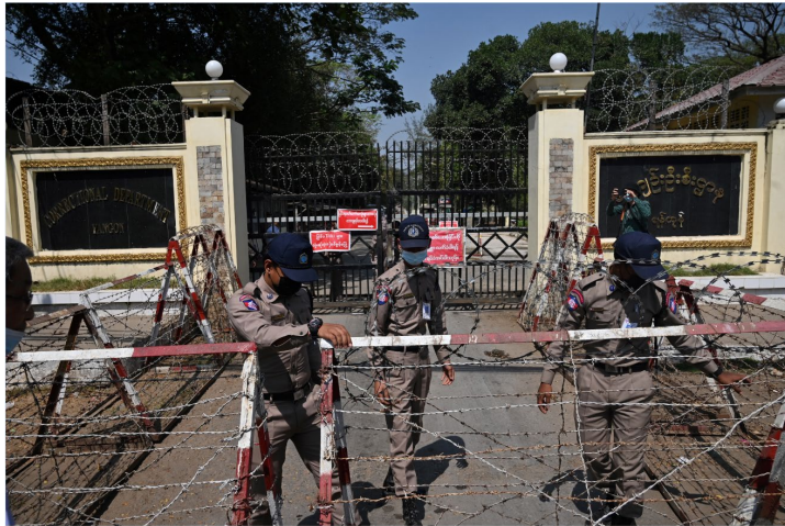
Prison officials stand outside the Insein prison in Yangon on 12 February 2022.

Decision adopted unanimously by the IPU Governing Council at its 210 th session (Kigali, 15 October 2022)