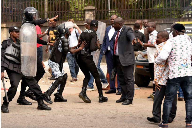
Riot police (left) confront members of the political party Generations and Peoples Solidarity (GPS) in front of the party's headquarters in Abidjan on 23 December 2019, after police intervened to evacuate party members.

Decision adopted by consensus by the IPU Governing Council at its 210 th session (Kigali, 15 October 2022) 2