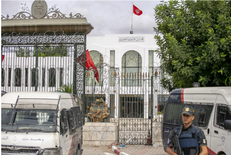
Tunisian security forces guard the entrance to the country's parliament in Tunis, Tunisia, on 1 October 2021

Decision adopted unanimously by the IPU Governing Council at its 210 th session (Kigali, 15 October 2022)