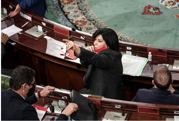
Abir Moussi (centre), President of the Free Destourian Party (PLD), lifts her face mask as she gestures during a parliamentary session as Tunisian lawmakers debate ahead of a confidence vote on the new government reshuffle by the Prime Minister at the Tunisian Assembly headquarters in the capital Tunis on 26 January 2021.

Decision adopted unanimously by the IPU Governing Council at its 210 th session (Kigali, 15 October 2022)