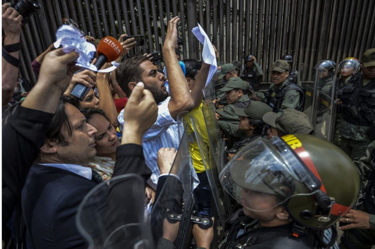
Venezuelan opposition deputy Juan Requesens, elected in 2015, argues with National Guard personnel during a protest in front of the Supreme Court in Caracas on 30 March 2017.

Decision adopted unanimously by the IPU Governing Council at its 210 th session (Kigali, 15 October 2022)