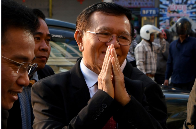
Former Cambodia National Rescue Party (CNRP) leader Kem Sokha arrives at the Phnom Penh municipal court for his trial in Phnom Penh on 22 January 2020.

Decision adopted by consensus by the IPU Governing Council at its 210 th session (Kigali, 15 October 2022) 1