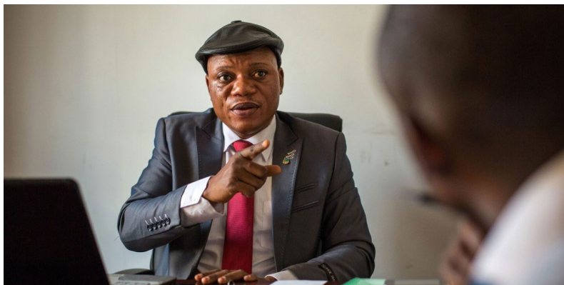
Jean Marc Kabund

Decision adopted unanimously by the IPU Governing Council at its 210 th session (Kigali, 15 October 2022)