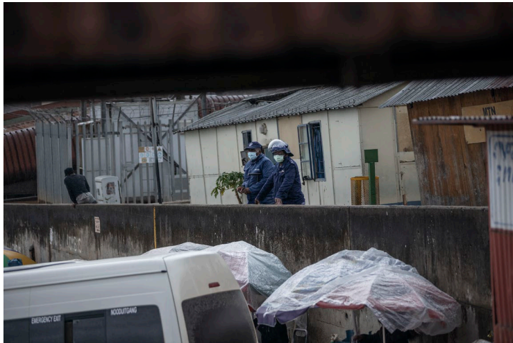
Members of the Royal Eswatini Police Service (REPS) monitor affiliates of the Trade Union Congress of Swaziland (TUCOSWA) as they sing political slogans in central Manzini on 28 October 2021 during a pro-democracy protest.

Decision adopted unanimously by the IPU Governing Council at its 210 th session (Kigali, 15 October 2022)