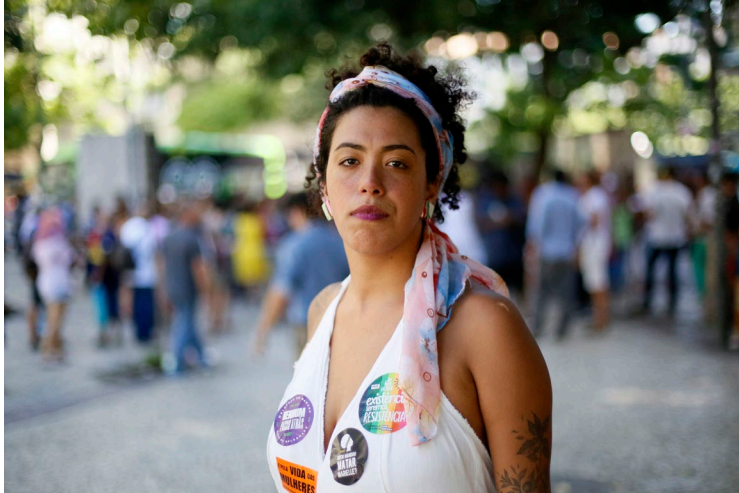
Brazilian federal deputy for the Socialism and Freedom Party (PSOL), Talíria Petrone, poses for a photo at a square in Rio de Janeiro's city centre, Brazil, during International Women's Day on 8 March 2019.

Decision adopted unanimously by the IPU Governing Council at its 210 th session (Kigali, 15 October 2022)