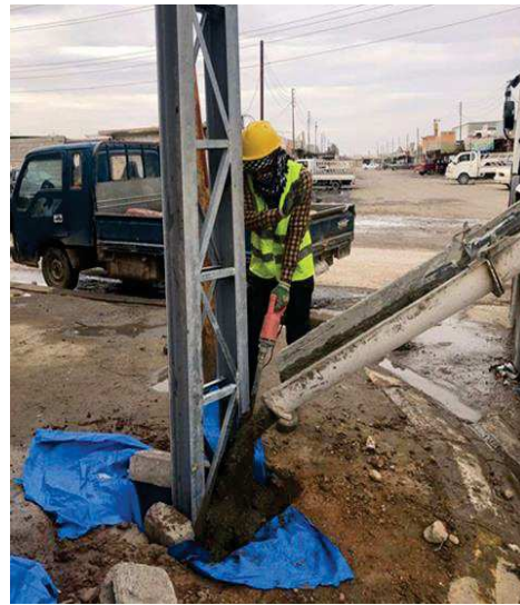
Excavation works for tubular poles are carried out (left) and lattice poles are installed (right).