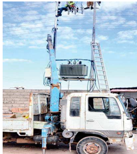
Transformers are installed and connected to the poles.