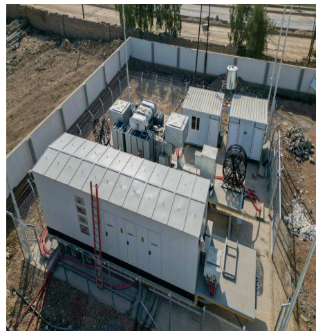
View showing the mobile substation in Hawija, installed.