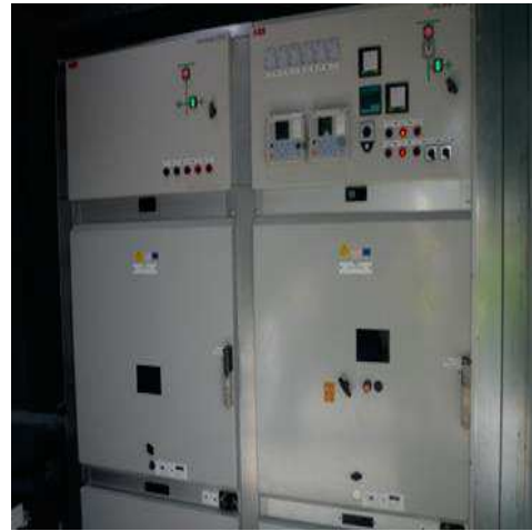
33Kva switch gear