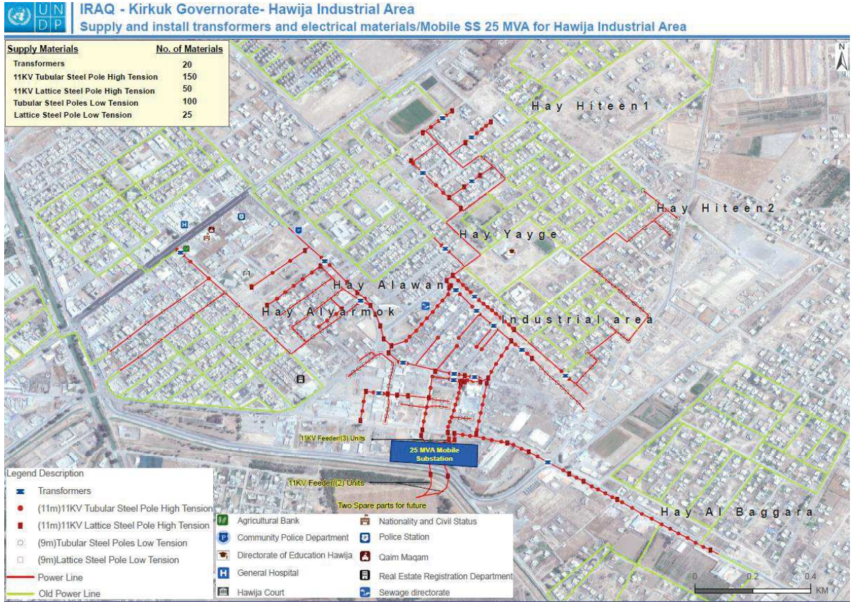
Map of final layout of electrical network in the Industrial zone