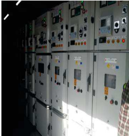
11Kva switch gear