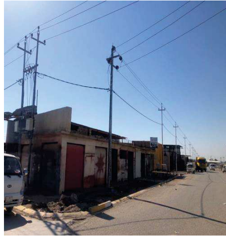
Parts of the electricity distribution network prior to rehabilitation and after the completion of works.