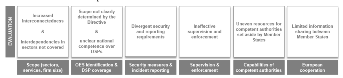
Figure 1: Overview of the outcome of the evaluation

An evaluation on the functioning of the NIS Directive (see Annex 5) was conducted as part of the review process required by Article 23(2) of the NIS Directive. The conclusions of the evaluation can be summarised into six main categories of findings (see Figure 1). These findings are further elaborated on in the problem definition described below, linked to the problem drivers (see section 2). They are regarded as underlying causes for the identified problems.