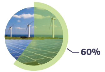
Bioenergy share in the renewable energy consumption*