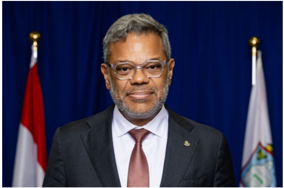
Luc F. E. Mercelina Prime Minister and Minister of General Affairs