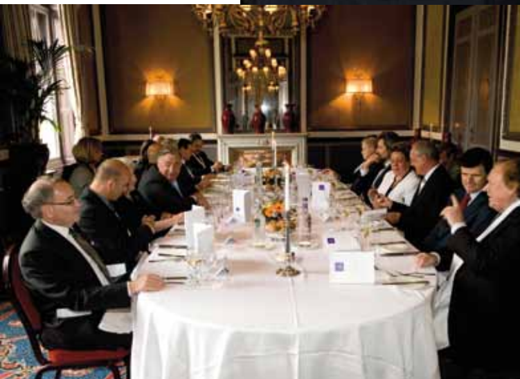
Presidents' lunch on Friday 17th April in the hotel 'Des Indes'