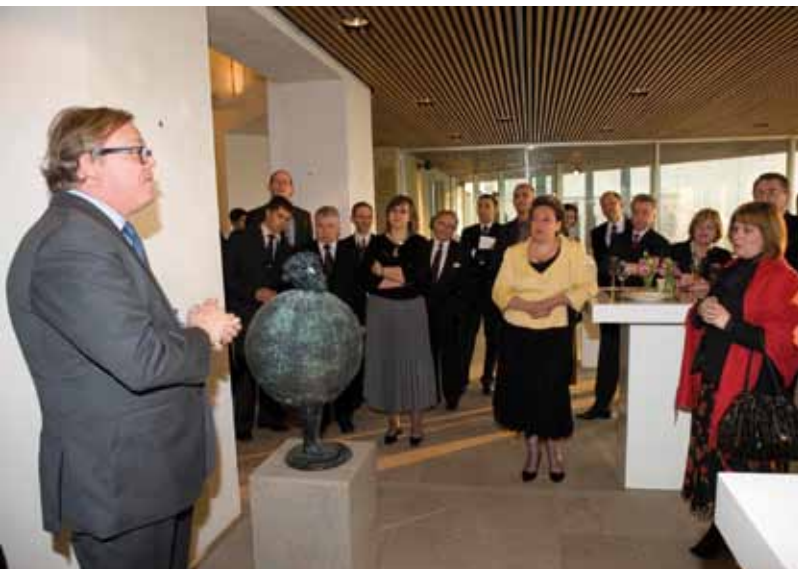
Reception and dinner at the museum 'Beelden aan Zee'