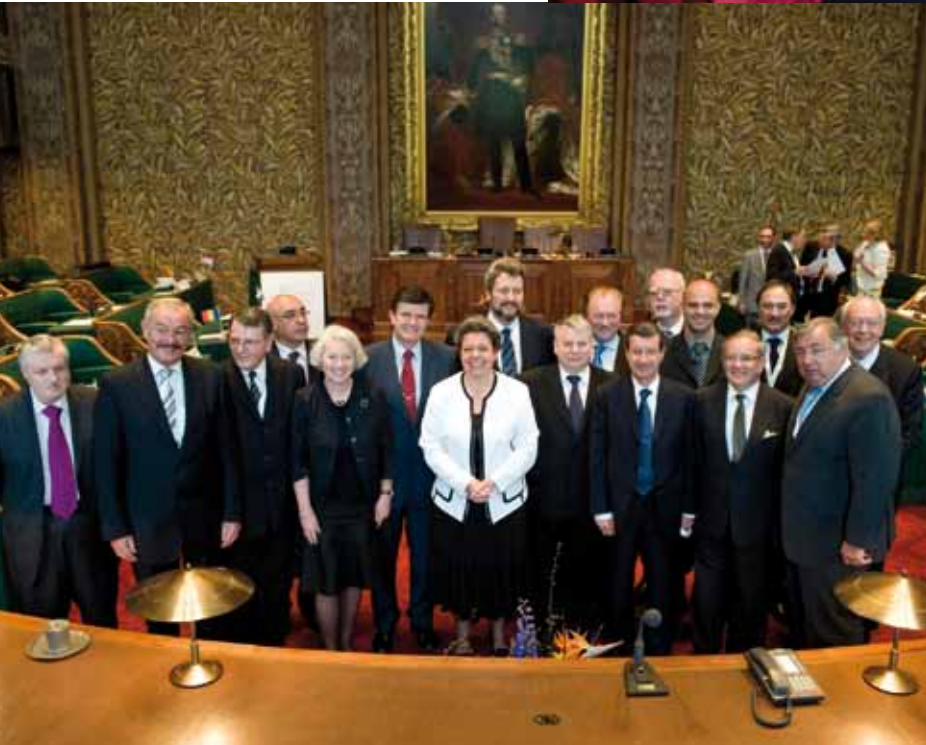
The Presidents of the European Senates