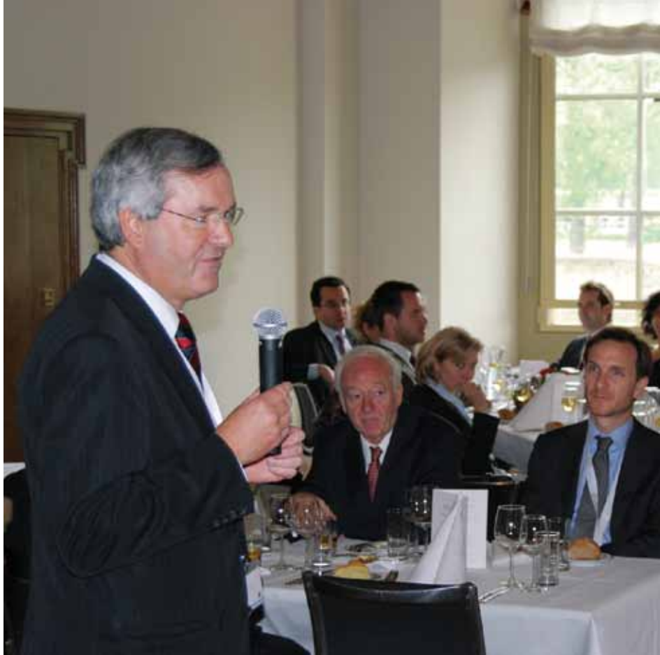
Lunch for the staffs of delegations on Friday 17th April in the Noenzaal of the Senate