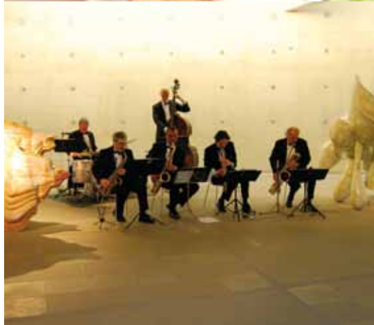
Dinner at the museum 'Beelden aan Zee' with musical accompaniment of 'the Hollywood Saxophone Project'