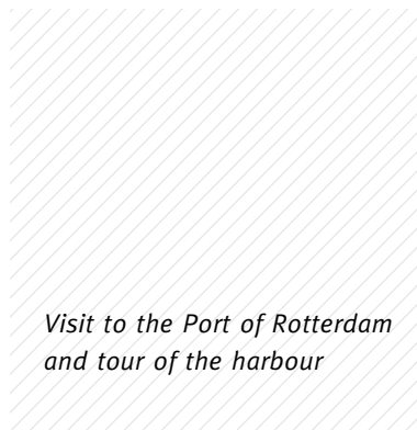
Visit to the Port of Rotterdam and tour of the harbour