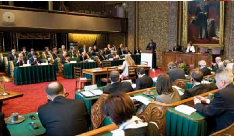
The meeting of XIth Conference of European Senates in the Plenary Hall