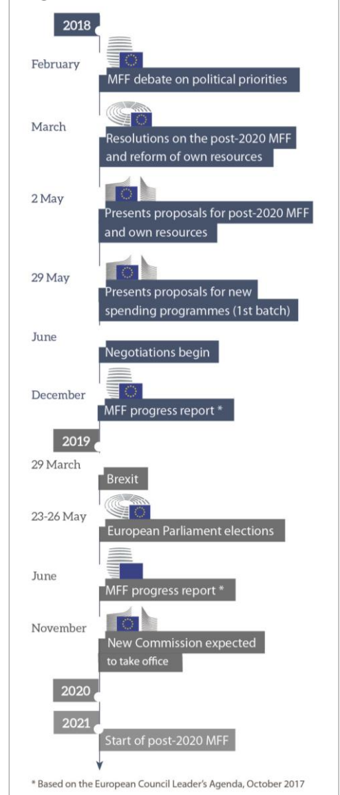
Figure 3 - Timeline for next MFF

The EU's system of own resources is often criticised as complex, opaque and outdated. 6 The prominence of the GNI resource and the system of rebates are thought to encourage Member States to focus on securing a juste retour , or 'fair return', from the EU budget, in the form of public and private sector receipts in their countries comparable to what they pay into the budget in own resources, instead of thinking strategically about how best to finance common objectives and