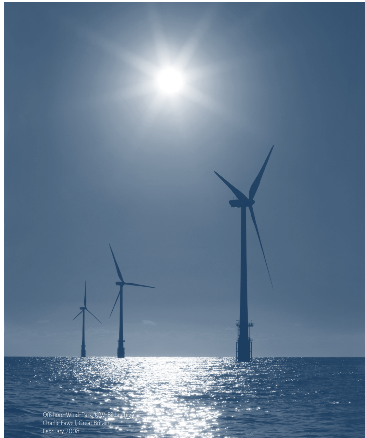
Offshore-Wind-Park, Great Britain, February 2008

Europe already has a highly efficient and secure payment infrastructure. Digital innovations and global trends have moved the demand for retail instant payment services into focus. To avoid fragmentation of the payment market, pan-European solutions should be decisively supported. Instant payments as a new payment infrastructure within the Single Euro Payments Area (SEPA) can play a major role.