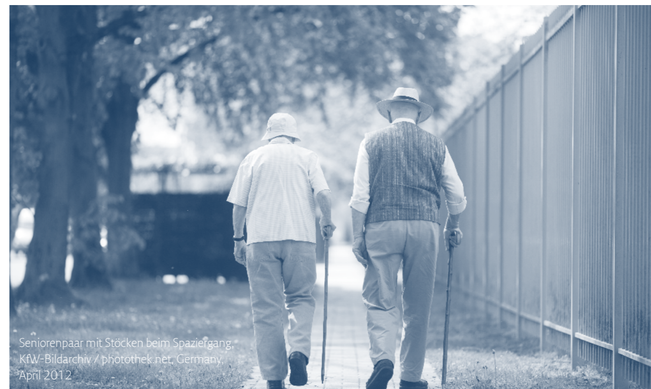
Seniorenpaar mit Stöcken beim Spaziergang, Germany, April 2012

Currently, solutions for instant payments at the point of interaction are regional or national and lack interoperability. The Next CMU Group therefore recommends the EU and the Member States to promote and support efforts to find a true pan-European solution.