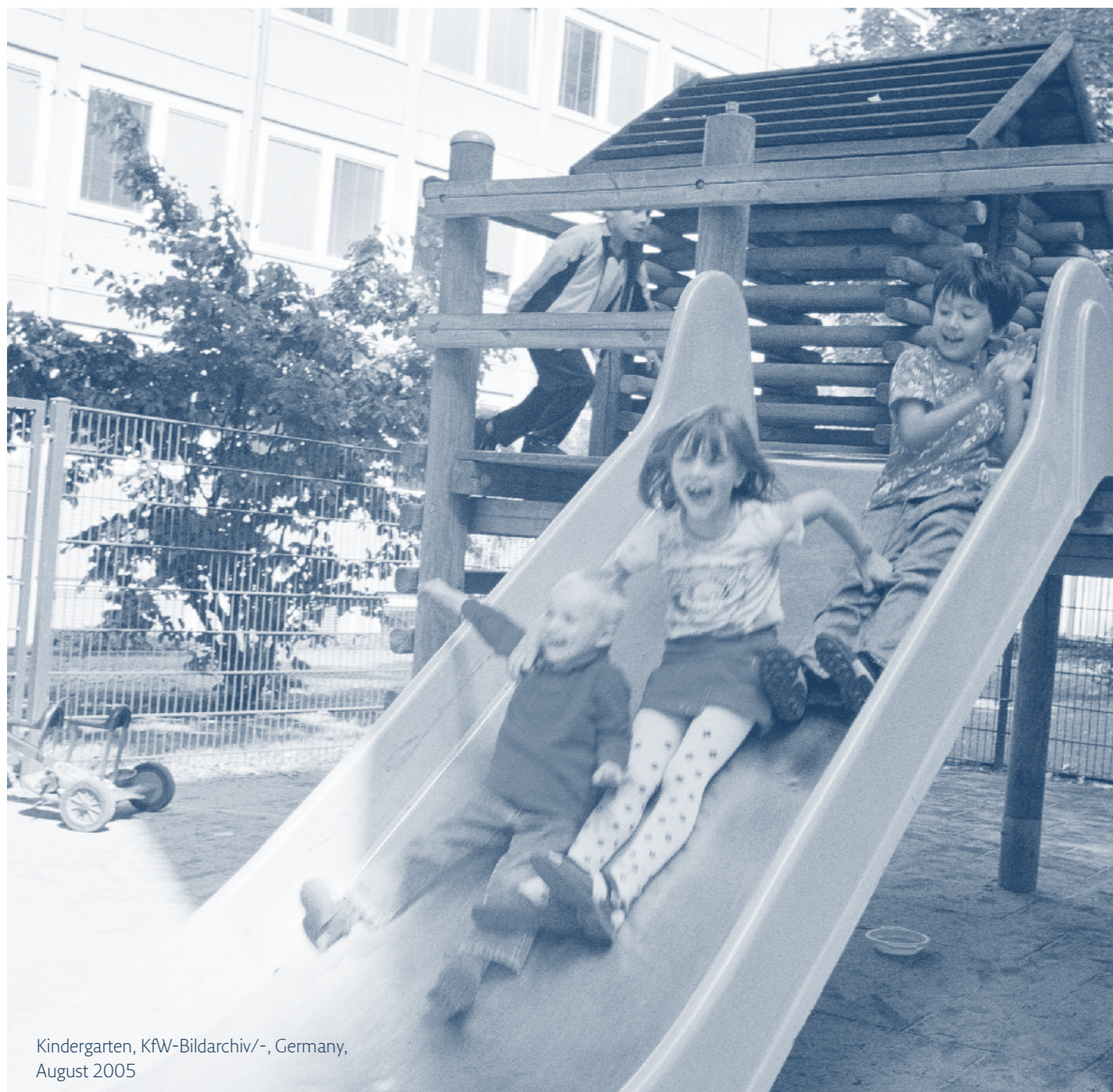
Kindergarten, Germany, August 2005