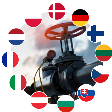
Flows of Russian gas in 2022 compared with previous years

12 Member States already suffer from full or partial disruption of supply. In June 2022, Russian gas supplies were below 30% of the average for the past 5 years.