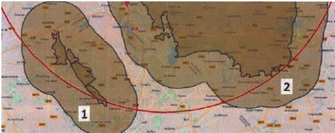
Figure 1 - areas for which subsidence and heave as cause of damage causes were investigated (areas outside circle numbered 1 and 2).

Chapter 1 presents the scope of the review. Chapter 2 elaborates on the review process used. It discusses the different parties involved, how the review was conducted and how the findings were combined into this report. Chapter 3 presents the details of the review. Lastly, chapter 4 summarizes the conclusions that can be made based on the results of the review.