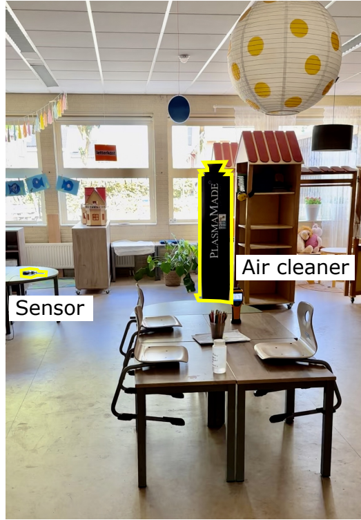
Figure 1: Image of the room where experiments were carried out.

of isopropanol, leaves a glycerin aerosol particle. One person sprays for 10 minutes while the air cleaner is off and then leaves the room, leaving the air cleaner off in one case and turning it on before just before leaving the room in the other case. Aerosol concentrations were measured by two air quality (SDS011) sensors placed on two different desks on different sides of the room. No one is present in the room during the measurement and windows are closed. Hence, the air flow in the room is set by (i) the normal ventilation system of the room (same in each CNS and OBS classrooms) which consists of supply and exhaust vents placed near the ceiling on the entrance wall, the supply vent delivering fresh (aerosol-free) air, and (ii) by the air cleaner when it is turned on.